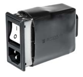
RC320 Rear Cover for Power Entry Module