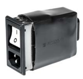
RC320 Rear Cover for Power Entry Module